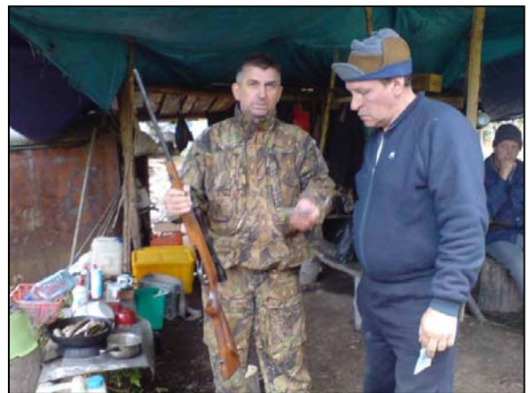
Team leader checks a gun license

On October 16, a local of Boguslavets village with a rifle was arrested 15 km far from Limonniki village. His gun license was overdue. The violator was charged with an administrative violation. On the same day, while patrolling the hunting grounds of Pozharsky district, the team detained three men for illegal hunting. The men were hunting during closed hunting season and killed 10 squirrels and two hazel grouse. Two illegal rifles were seized and forwarded to a local police office. The wildlife managers drew up a report on violations of hunting regulations on each poacher.