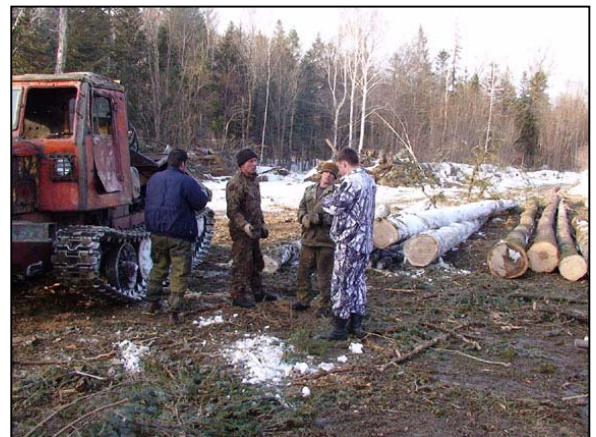
An illegal logging site discovered

On March 15, during a routine patrol in Dalnerechensky district the team revealed an authorized cutting of Korean pine and oak trees. Four loggers were apprehended and taken to Dalnerechensky police station for further investigation. A criminal proceeding was initiated.