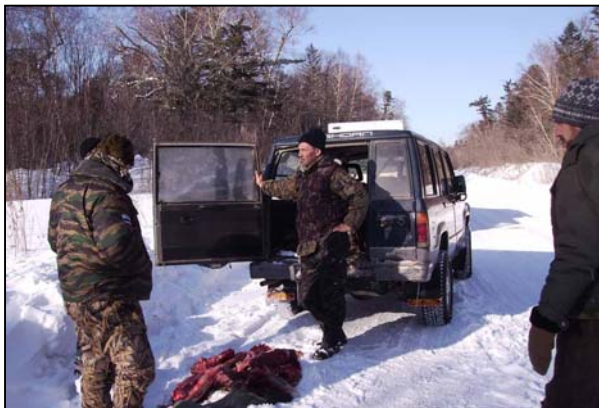
© Phoenix Team found poached prey in a car

On January 3, while patrolling hunting grounds near Salskoye village, Dalnerechensky district, the team detained a man with a 16-gauge smoothbore firearm for hunting without a hunt permit, hunt license and gun license. The inspectors issued an administrative citation, seized the shotgun to hand it over to Dalnerechensky police station and imposed a fine of 2,000 roubles ($68).