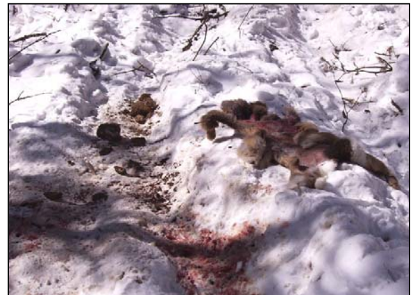
Two roe deer skins found near a logging site on March 30, 2010

On April 9, a man was apprehended on hunting grounds of Dalnerechensky district for illegal waterfowl hunting. He had neither a hunt permit nor gun license. The violator paid a fine of 1,000 roubles ($34).