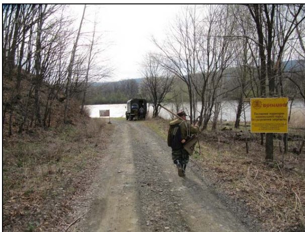
© Phoenix Mobile check-point at main road

On April 19-26, the mobile team of four inspectors carried out a regular patrol and during the seven days registered no infringements.