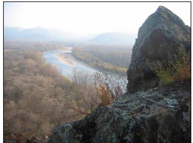
© Phoenix Fund Laulinsky prizm famous rock at the Udege Legend Park

resolve predator-human conflicts and emergencies (people disappeared in taiga, first aid etc) and have explanatory talks with the local communities. The teams patrolled the Park on a daily basis by vehicle, boat and on foot. They checked visitors and stopped illegal woodcutting. In 2010, with the help from the Kolmarden Fund Raising Foundation and 21 st Century Tiger, a snowmobile was purchased for law enforcement inspectors to patrol the area after major snowfalls, conduct winter animal surveys and organize rescue operations to save ungulates stuck in snowdrifts. Within the framework of the project, the anti-poaching brigades of the Park were provided with fuel for patrols and spare parts for their vehicles.