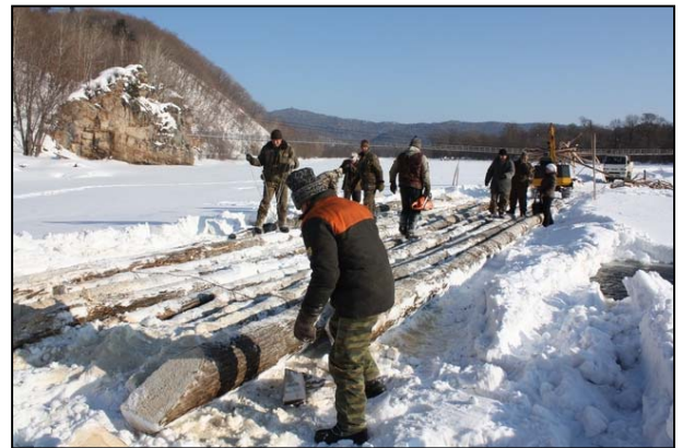
Phoenix Park staff makes crossing over the Bolshaya Ussurka river