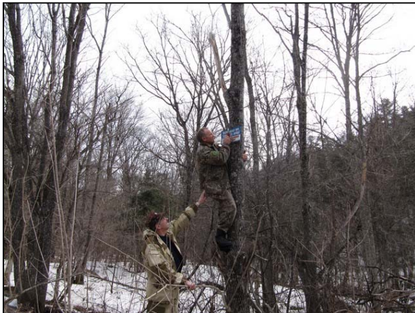
Hanging information signs along the Park boundaries

On March 1-8, 2010 the team made up of four law enforcement officers patrolled along Dalny Kut – Agapov spring – Levomikhailovsky spring - Dersu village route. On March 2, while the team was repairing a snowmobile a vehicle passed by. The inspectors caught up the car but the driver had no park visit permit therefore an administrative report was written. Later the two inspectors went on a patrol to a tourist recreation site and noticed unleashed dogs. The first warning was made to a camp's guards who put the dogs on chains immediately. During the rest of the patrol the team was inspecting the territory of the national park on a snowmobile or on skis. No violations were revealed.