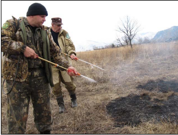
Inspectors conduct controlled burn

three inspectors was conducting a patrol on the Dalny Kut village - Agapov spring – Zabolnoe hole – Dersu village route. The detected no cases of infringement.