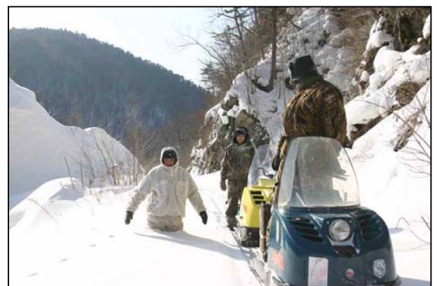
Hard winter conditions

On February 1, the law enforcement personnel of the Park went to pass "qualifying exams" in order to continue conducting anti-poaching patrols. From February 2 through February 5 the team of four officers patrolled the Park's area to prevent trespass or illegal hunting. While moving along the Park's road the guardians observed numerous tracks of wild animals, mostly roe deer and red deer. No violations were revealed. On February 6, during the daytime the team members repaired their snowmobiles and in the evening patrolled on the road till 8 p.m. No movement was recorded. On the following day the law enforcement officers patrolled by two groups. One of the groups detained a trespasser and made a warning notice that presence on the protected area without entry permit is strictly prohibited.