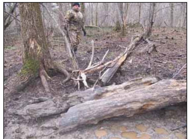
© Phoenix Rangers discovered illegal salt lick

On May 10-17, a group of two inspectors made a motorboat patrol. They destroyed three fishing nets and an illegal salt lick made by poachers to attract animals. They checked two authorized salt licks and found no violations. One of the inspectors heard a gunshot in the vicinity of a salt lick, but no people were seen.