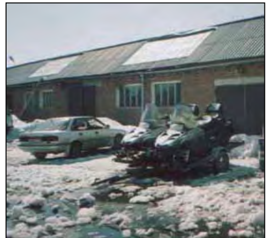
Confiscated snow mobiles

Bikin river in Pozharsky district. In the neighborhood of Krasny Yar village they stopped Mr. Saronov who fished with nets during spawning season. They confiscated the nets and made up a report on the man.