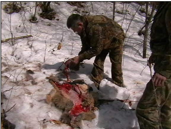
Wildlife managers found poached deer