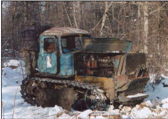
Wildlife managers found an abandoned tractor

On January 30, the team patrolled hunting grounds of Dalnerechensky district 14 km far from Zimniki village and found a 16-