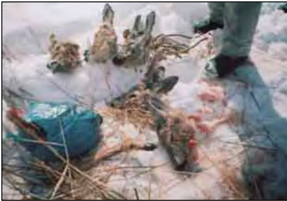
Confiscated roe deer heads