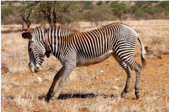
Collared Grevy's zebra

in the Wamba area, and will continue throughout 2011. Male Grevy's are territorial and tend to remain within these locales for extended periods. For this reason only females are targeted in this project as they move over greater distances and hence reveal the pattern of landscape use. Due to the drought conditions, which naturally weaken the animals' body condition, we have been very selective about when we immobilise the animals in order to avoid the risk of capture stress.