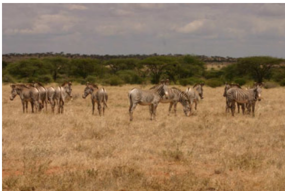
Grevy's zebra north of Lewa

We begin with a brief summary of the current status of Grevy's zebra.