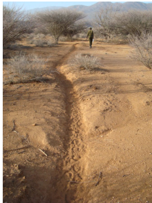
Track to well near Arsim

While we have been busy training and developing the Trust's capacity to monitor and manage conservation work, we have also had several camera traps deployed on regular long range patrols through the Milgis ecosystem. A rich biodiversity of small, medium and large mammalian species has been detected already. Most promising is the evidence that Grevy's zebra are utilising key water sources and travelling long distances along well defined routes between grazing areas and key springs, wells and pans in the Milgis area. We were very surprised to find larger groups of 10 and more (as determined by their tracks) visiting water points along the foothills of the Ndoto mountains near Arsim.