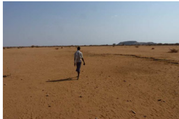
Feeding location near Manyatta Lengima

You will be all too aware of the drought conditions, the worst in 90 years, which the Horn of Africa is currently enduring. This not only affects the millions of people living Ethiopia, Somalia and Kenya but also the wildlife. GZT has now developed a drought response strategy to ensure the wild Grevy's zebra survival through the extended drought conditions.