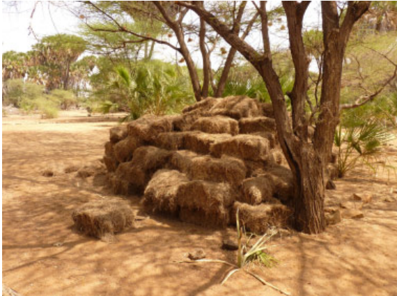
Feeding station in Melako conservancy

to monitor the pre-activity condition of the species concerned, the process of intervention, its effect on the target species and the post intervention condition of the target species to ensure that no deleterious effects result from the activity itself. Feeding stations have been set up at water holes in the Laisamis area and fodder is distributed in the late afternoon to ensure that livestock do not have access to it before wildlife. Marwell is monitoring hay utilisation through the deployment of camera traps at feeding sites.