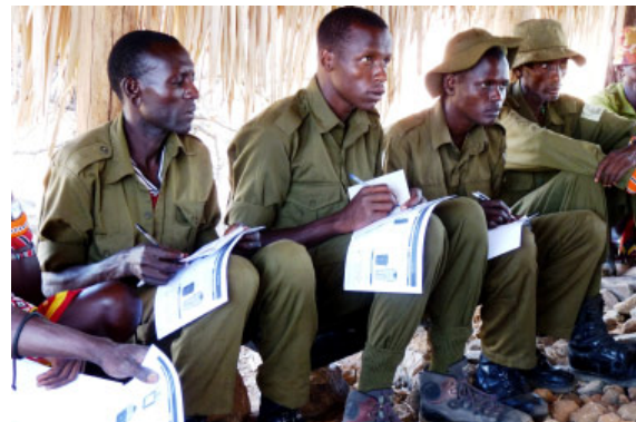
Scouts during lesson

In 2012 we will continue our programme of training and developing the Trust's members. Additionally, we will be assisting with wildlife water management projects in the Milgis to ensure that water is available for Grevy's despite high densities of livestock. Furthermore, we will be deploying targeted camera trap surveys at key water holes to learn more about how Grevy's access water and whether there are any limiting factors preventing them from doing this.