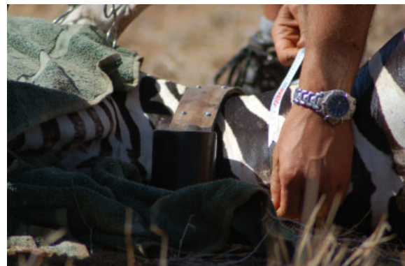
Grevy's zebra collaring Wamba

We told you in last year's report about our plans to deploy 25 Grevy's zebra with new collars that use the mobile phone network to download their information. Not only would we replace some old and by now dysfunctional collars but we would add new ones to increase the number of animals being monitored. This will enable us to determine the importance of key resources (e.g. water and vegetation use) and critical seasonal ranges for the population. This information will improve the management of key land and resources for Grevy's zebra.