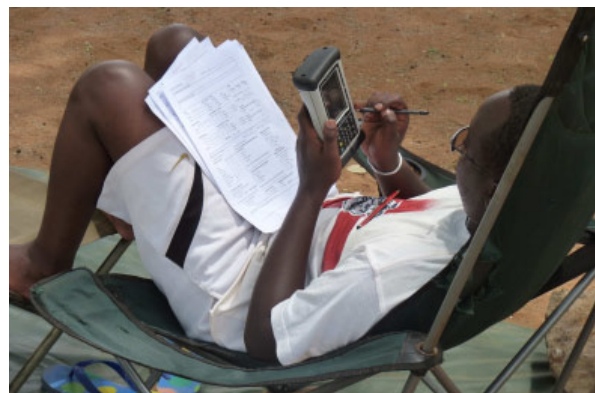
Data entry using Trimble Nomad

There are now 19 conservancies in the NRT network and all of them offer a unique opportunity for pastoralism and wildlife conservation to be integrated. They are of great importance to Grevy's zebra conservation; e.g. the Kalama conservancy harbours ~100 individuals, while Meibae conservancy hosts 4-500 Grevy's during certain times of the year. The conservancy system seeks to carefully manage live stock grazing, and at the same time encourage wildlife to co-habit pastoral areas.