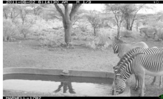
Camera photos in water access study

come to drink and how far they are travelling to get there. Data on other wildlife, including predators, using the water points was also collected. Following analysis, Peter should be in a position to make recommendations for future water management intervention for the benefit of wildlife, livestock and people alike. All things going well, Peter will graduate in September this year.