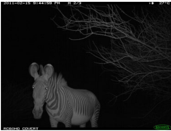
GZ in same track at night

With geo-referenced data becoming more available, we have begun to map the study area and a useful picture of the landscape and the Trust's coverage of the area is emerging. Soon we will be able to plot the positions of Grevy's zebra sightings and begin to understand which parts of this landscape function as important resources for their survival here.